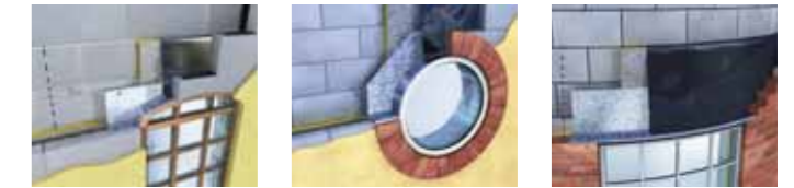
Parabolic Arch Lintel Bull's Eye Lintel Curved On Plan Lintel